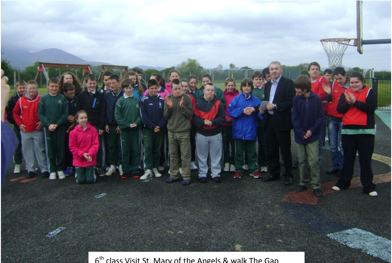
6 th class Visit St. Mary of the Angels & walk The Gap